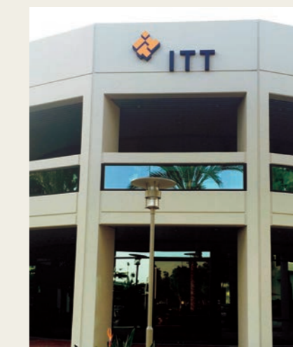
ITT Cannon Irvine, CA

ITT provides lightweight and reliable aerospace products to the rotorcraft industry.