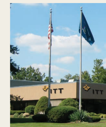
ITT Enidine Inc. Orchard Park, NY